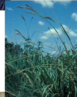
Eastern gama grass