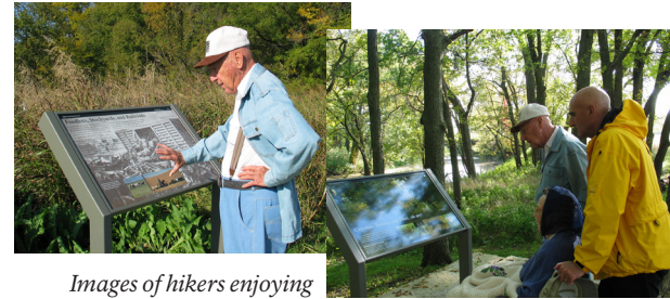
Images of hikers enjoying the Bottomland Trail