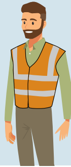
VA Forest Manager

The Nature Conservancy's forest managers INCREASE the rate of CO 2 removal by growing a healthier, more diverse forest