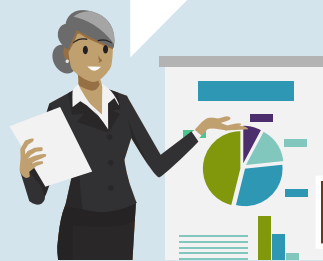
CA Utility CEO

Buying CARBON OFFSETS to cover up to 8% of my emissions makes good business sense.